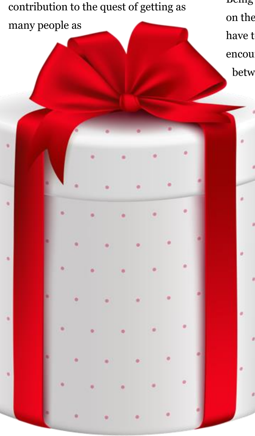
possible to sign on as subscribers and these giveaway exercises are now

This will has the benefits of having the products successfully exposed and used by the potential be scribers which in turn could